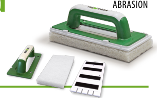
CLEANING AND ABRASION