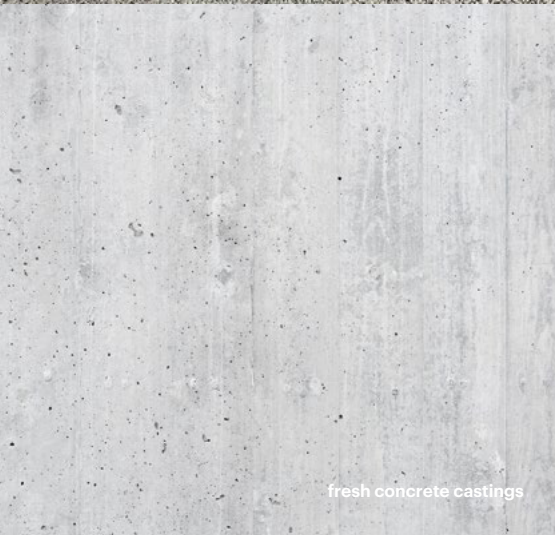
fresh concrete castings