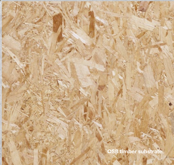
OSB timber substrate